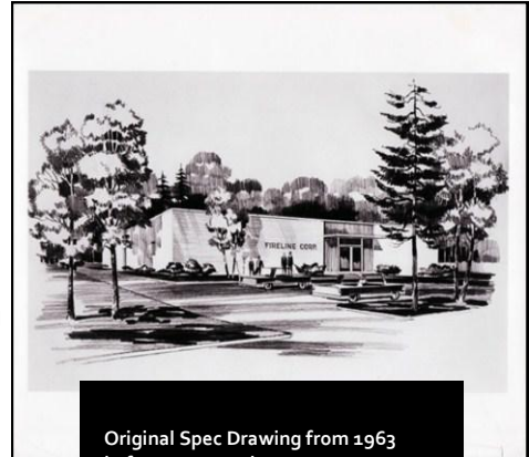
Original Spec Drawing from 1963 before construction

So there you have it, the many changes of Building 1. By upgrading the building we hope to make it a better usable space, a nicer environment for our in-house staff, and hopefully make it last a little longer before we burst at the seams!