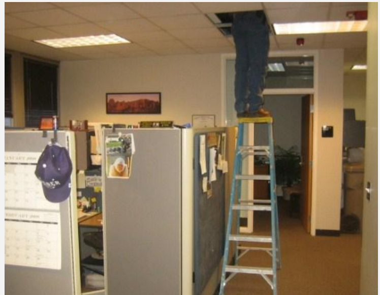
While walking through an agency, you couldn't help but notice a repair technician working up inside the drop ceiling in the office...