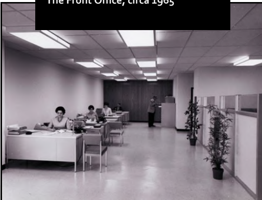
The Front Office, circa 1965